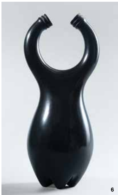
1 Al Qöyawayma's Uxmal: Governor's Palace , 10 in. (25 cm) in height, native clay, 2016. 2 Autumn Borts-Medlock's Parrot , 5 in. (13 cm) in height, native clay, 2016. 3 Les Namingha's Zig-Zag , 10 in. (25 cm) in diameter, native clay, acrylic, 2016. "Twenty Years of Excellence in Native Clay," at King Galleries ( www.kinggalleries.com ) in Scottsdale, Arizona, through February 2. 4 Kenji Uranishi's Dome , 14 in. (36 cm) in diameter, porcelain, 2016. 5 Roderick Bamford's Sonic Loop Green , 15 in. (38 cm) in height, porcelain, 2009. Photo: Helene Rosanove. "Scape," at JamFactory ( www.jamfactory.com.au ) in Adelaide, South Australia, February 16–April 23. 6 Jami Porter Lara's LDS-MHB-GSBR-0416CE-01 , 12½ in. (32 cm) in height, pit-fired clay, 2016. Courtesy of Ona Porter and Miriam Rand. 7 Jami Porter Lara's LDS-MHB-LPBR-0416CE-01 , 9 in. (23 cm) in height, pit-fired clay, 2016. Courtesy of Emilie Porter-Rand and Marc Basiliere. 6, 7 Photos: Geistlight Photography. "Border Crossing," at National Museum of Women in the Arts ( www.nmwa.org ) in Washington, DC, February 17–May 14.